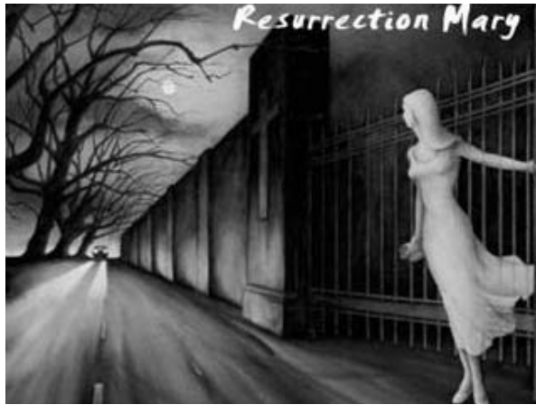
The 1st Annual Chicago Paranormal Meet and Greet will be held in the Outdoor Picnic Grove at Chet's Melody Lounge, 7400 Archer road, Justice on Saturday, Aug. 20th from 1 to 6 p.m. Admission is free. The location is across the street from Resurrection Cemetery where the hitchhiker ghost of Resurrection Mary has been seen. The program will feature guest speakers, classes, authors, owners of haunted locations and numerous paranormal investigation teams.